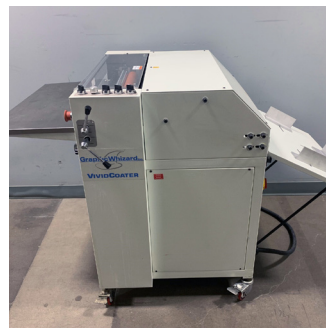
G-Whiz VividCoater UV Coater $7,995 $7,495 Up to 2700 sph; stocks up to 450gsm, 27.5"w