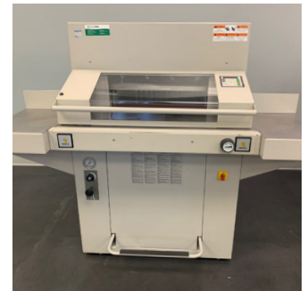
EBA 550EP Hydraulic Paper Cutter $7,995 $6,995 Fully programmable; adjustable hydraulic pressure