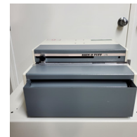
Rhin-O-Tuff HD 6500 $2,995 $2,495 Comes with a NEW 4:1 coil die