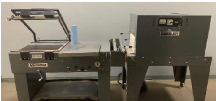
Beseler T-18-8 Shrinkwrapping System $8,995 NOW ON SALE $6,495 18" wide, 8" tall and 36" long tunnel chamber w/ adjustable air damper and auto cool down.