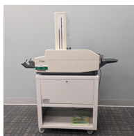
Horizon PFP 330 Folder $5,995 $4,995 Quiet & reliable; easy to use interface