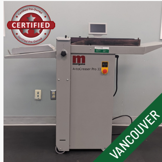
Demo Model Morgana Autocreater Pro 33 $17,995 $16,495 Crease 12.6"x27.5" up to 400gsm; 8500sph