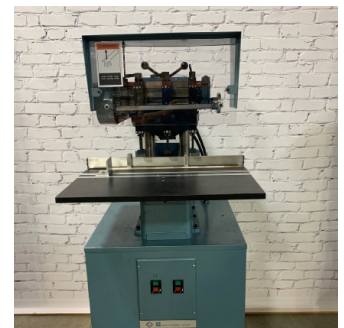
Baum K3 Hydraulic Paper Drill $3,495 $2,995 3 x Adjustable drilling heads - includes extra drill bits