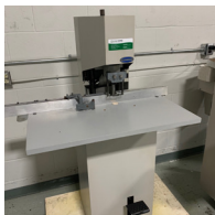
JF Drill $1,995 $1,695 Floor pedal operated with 2" drilling capacity