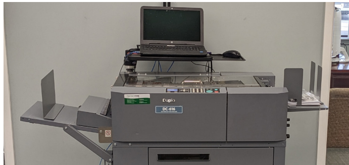
Duplo DC-616 Pro Slitter/Cutter/Creater with PC and PC Arm $14,995 $13,995 Fully automated finisher can process up to 6 slits, 25 cuts, and 20 creases in a single pass. Includes PC with software