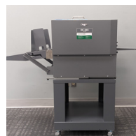
Duplo DC-445 Creaser $7,995 $7,495 High-speed creasing; includes perf module