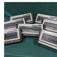
Dies for Akiles Flexipunch $250 $150 Assorted dies available

RECONDITIONED EQUIPMENT INCLUDES 100-DAY PARTS & LABOUR WARRANTY | CONTACT US TODAY! 1-800-668-6055 OR SALES@PRINTFINISHING.COM