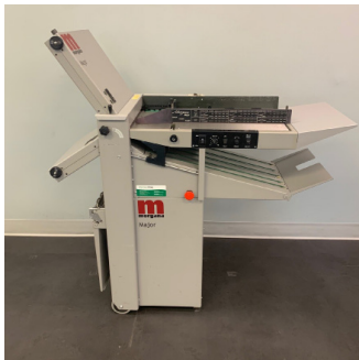
Morgana Major Folder $7,995 $7,495 18 x 25 high-speed air feed folder w/ perfin