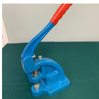
Micron Grommet Press $250 $195 Manual tabletop grommet press