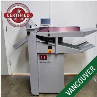
Morgana Docufold Pro $10,995 $9,995 Automated high-speed air feed folder w/perf