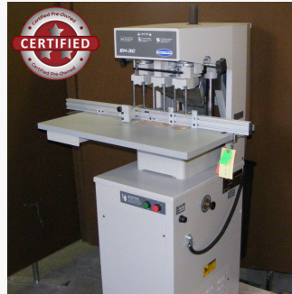
Challenge EH-3C Drill $7,495 $6,995 2.5" drill capacity; 4.5" backgauge depth