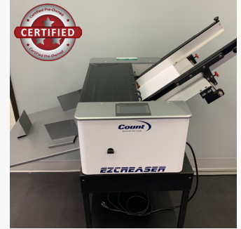
Count EZ Creaser $8,995 $7,495 Friction feed creasing; sheets up to 18" x 20"