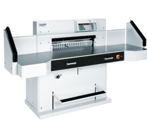
28" 7260 LT

The EBA 5560 Paper Cutter is the most powerful cutter in its class. Offering a 21.6" cut width and with fully adjustable clamping pressure, the EBA 5560 will cut an astonishing 3.75" of paper with ease. The fully programmable touch screen backgauge control with 99 programs (99 steps each) drives a hydraulically powered high speed cutting knife. A unique multiple cut programming function allows simple creation of programs for the accurate cutting of business cards and other multiple-up applications. The front table surface is protected by a photocell safety system. Soft foot pedal for pre-clamping, LED cut line light and false clamp plate are standard features. The EBA 5560 LT offers all the above benefits along with an air table to allow easy movement of paper.